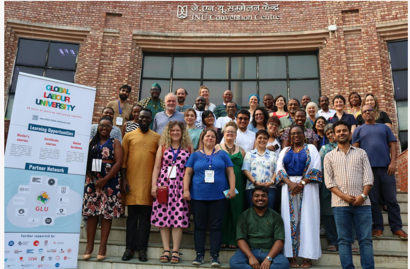
GLU Alumni Workshop, Sept 2024, India

Learn more at: https://global-labour-university.org/